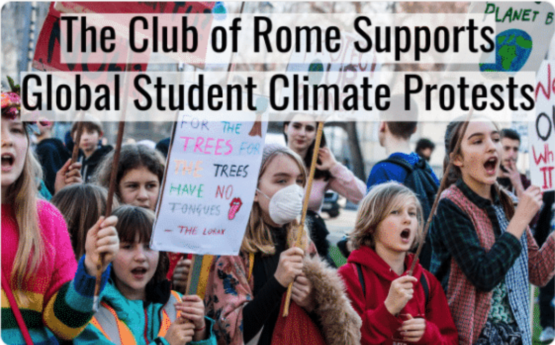
3:37 AM - 14 Mar 2019

The Club of Rome deems the students’ concerns to be utterly justified and calls on governments to listen to the call for urgent action from young people, scientists and experts across the globe. Full Statement: bit.ly/2Jb4409 #FridaysForFuture #ClimateStrike